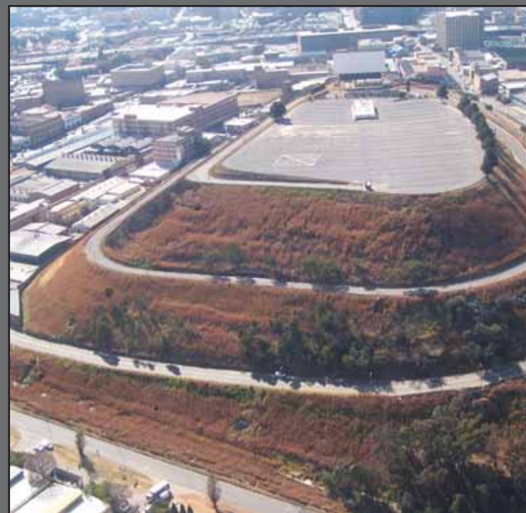
The Top Star dump, visible from the M2 highway

The mining right for the dump has been granted until 20 August 2013. The project is expected to contribute some 1.276 kilograms of gold per year over its estimated three-year life. The