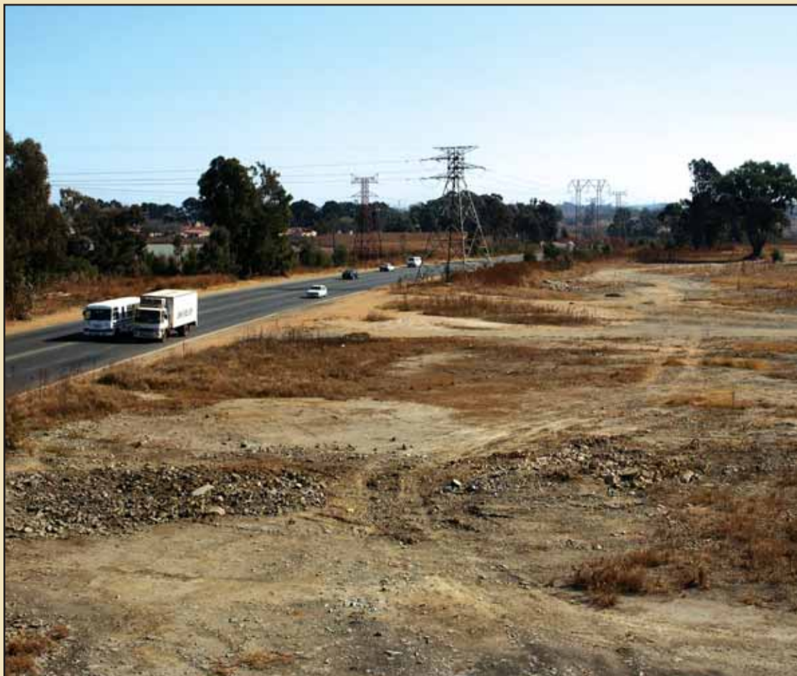
Property currently owned by ERPM, set aside for residential and commercial development

Cash generated by the first project will be applied to a number of other projects, enabling the property division to meet its objective of creating opportunities for making low-cost housing available to the communities surrounding ERPM.