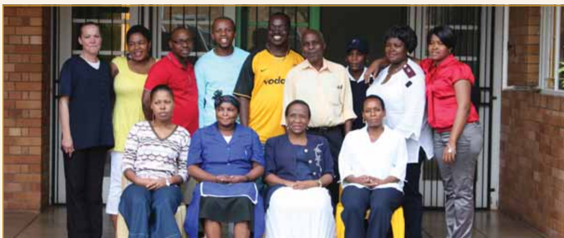
Pioneering staff members of the new occupational health centre

Team Crown has previously come close to winning, achieving both second and third place, but is now finally the proud holder of the winner’s trophy.